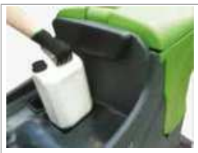
INTEGRATED CHEM DOSE