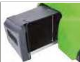
LARGE FRONTAL WASTE TRAY