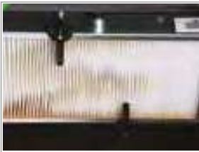
ELECTRIC FILTER SHAKER