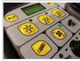
EASY TO USE CONTROLS