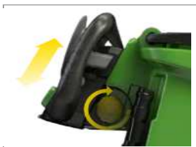
ADJUSTABLE HANDLE FOR A COMFORTABLE AND EASY USE