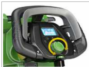
FULL MACHINE CONTROL DUE TO INTUITIVE CENTRAL KNOB